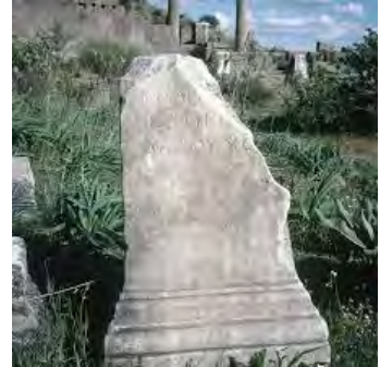
An ancient monument to an 'unknown god' found in Turkey

God is a Life Changer through Belief vs32-34